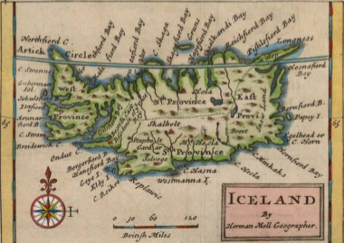
ICELAND By Herman Moll Geographer.