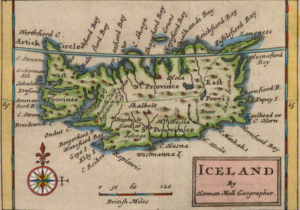
ICELAND By Herman Moll Geographer.