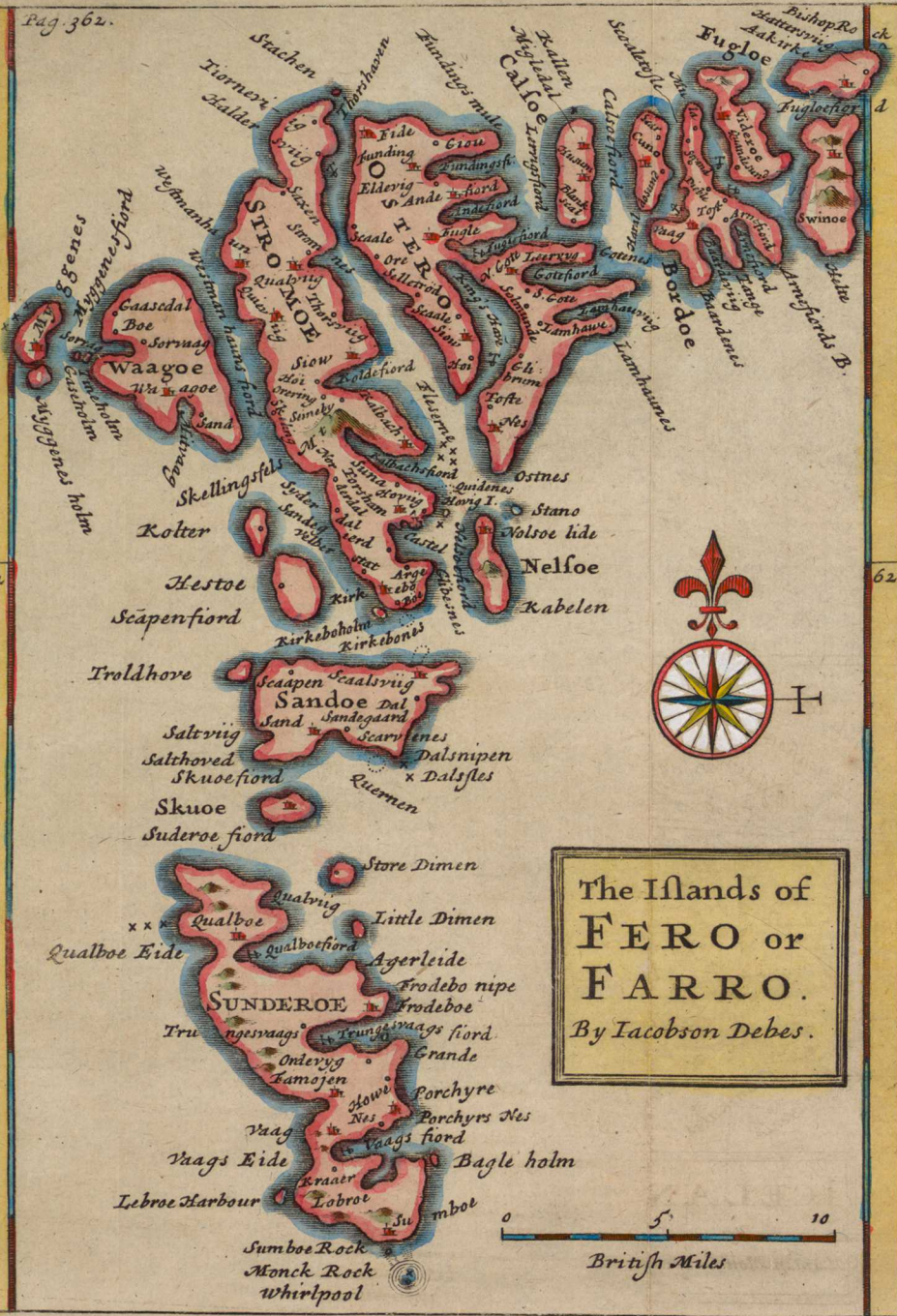
The Islands of FERO or FARRO. By Jacobson Debes.